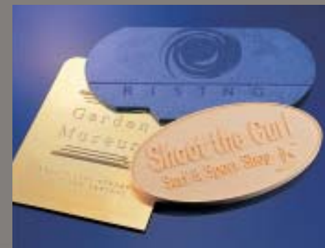
Software : Dr.Engrave