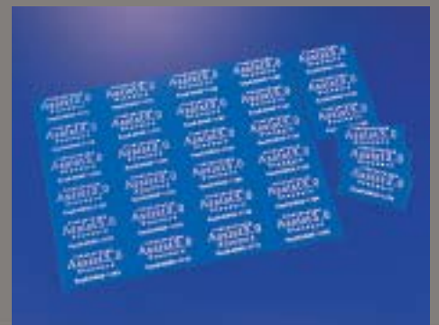
Software : Dr.Engrave