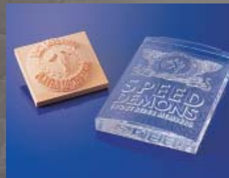
Software : 3D Engrave